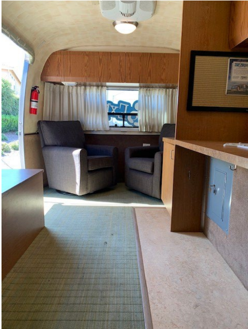
D. Interior: Side with Changing Table Only